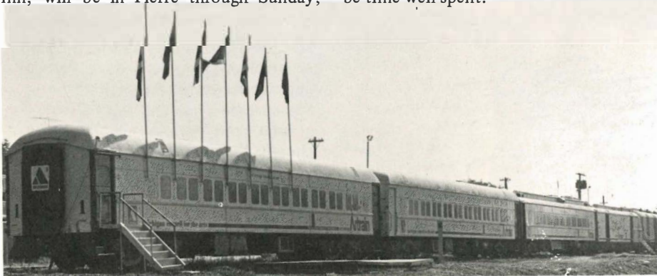
Artrain is a six car art museum featuring art work from all ages, forms and countries.

They will cheer for the first sophomore football game September 15 at Gettysburg.